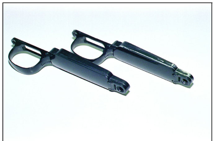
FIG # 6