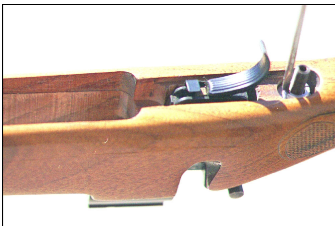
FIG # 5