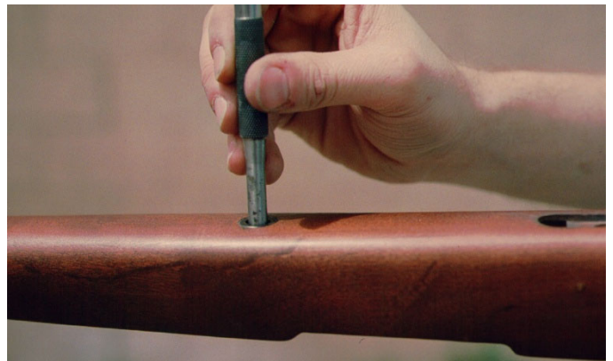
FIG # 4