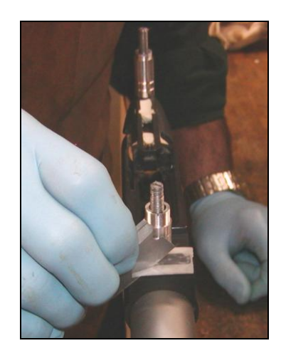
FIG # 6