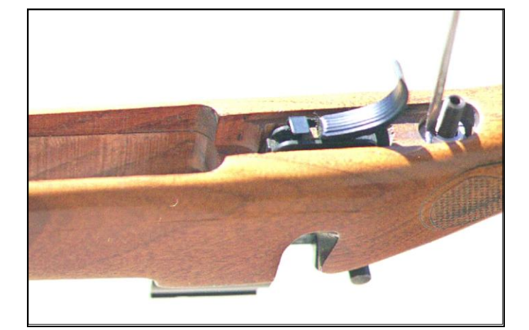
FIG # 3