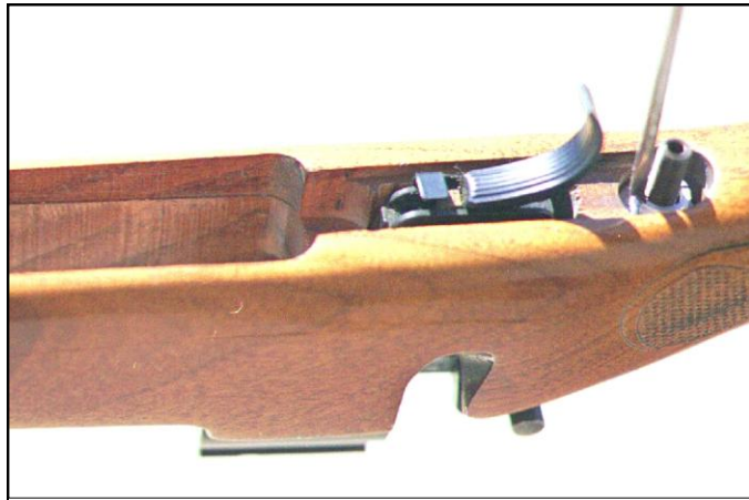
FIG # 5