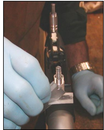
FIG # 6